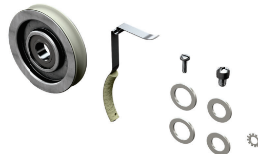
TYPE A 3.25 DIA.. ROLLER REPLACEMENT KIT (HH1-0025N)*