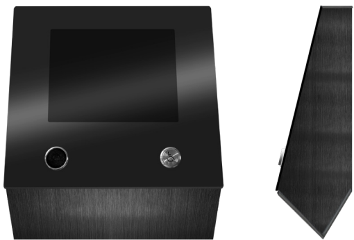
Surface Mounted DD Kiosk

The Destination Dispatch Kiosks provide a touchscreen solution with an enhanced user interface for your elevator passengers. Bring a versatile high-end look to your building and provide your passengers with a fixture that not only gets the job done but feels good when using it. This leading technology is non-proprietary, so it is seamlessly integrated into your building.