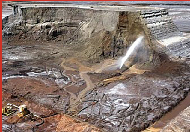
Hydraulic-pressure strip mining

With rare-earth minerals being so vital to support a wide range of products spanning many industries, a high-grade deposit of rare-earth metals, a previously mothballed U.S. mine called the Mountain Pass Mine located on the California/Nevada state line, was recently bought out of bankruptcy by MP Materials. Once operational, MP Materials will need to ship material to China for further refinement, but the company is projecting further development of U.S. refining operations.