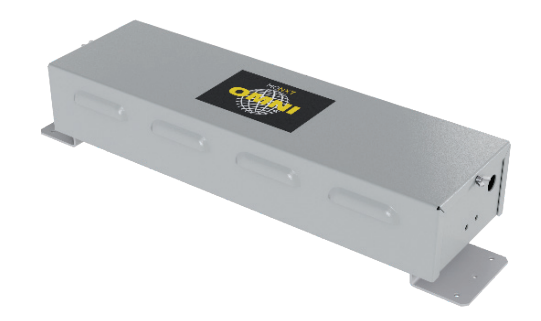
MONXT DRIVE ASSEMBLY w/ PARAMETER UNIT 230V and 115V