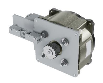
MOTOR ASSEMBLY w/ MOUNTING BRACKET