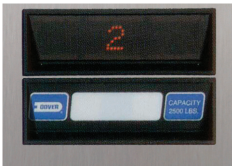
Before Impulse+ retrofit