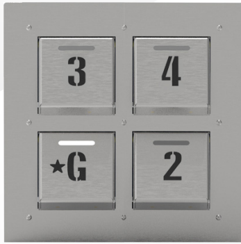
Toe-To-Go foot-activated call buttons, available in Stainless Steel or PVD Brass.