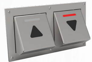
Hall stations, surface or flush mount, available in Stainless Steel or PVD Brass.