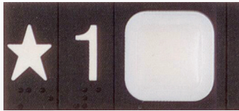
Impulse Fixture pushbutton