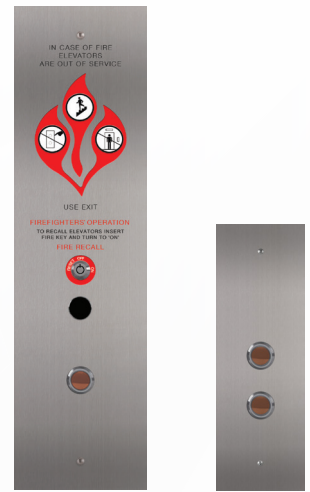
Hall Terminals with and without Fire Service with BS Copper pushbuttons