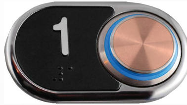
BS Copper pushbutton with Julius surround